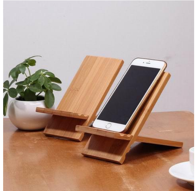
Simple style solid bamboo Iphone stand for mini. Size 80 x 60 x 20mm for used in Car etc.