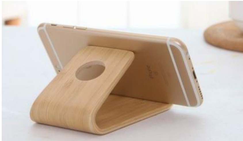
Creative style solid bamboo Phone Stand of mini size 120mm.